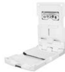
White Polyethylene Vertical