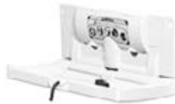
White Polyethylene Horizontal